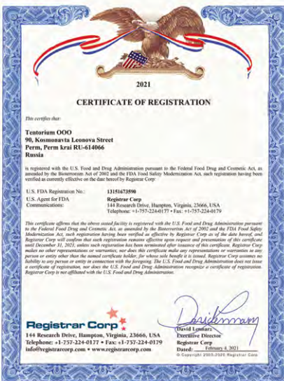
FDA CERTIFICATE DATED FEBRUARY 04, 2021

TENTORIUM® pays special attention to quality assurance and product safety in accordance with the requirements of ISO 22000 (HACCP) and FDA systems.