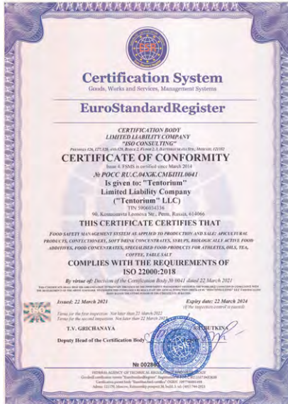
ISO 22000 CERTIFICATE (HACCP) DATED OF MARCH 22, 2021